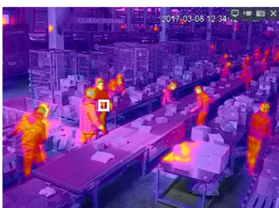
Fire Detection & Alarm Output