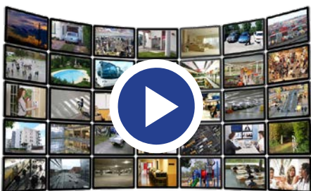
Large Scale Surveillance Management