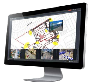
Visualise System with Emap