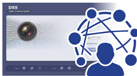
Powerful User Management